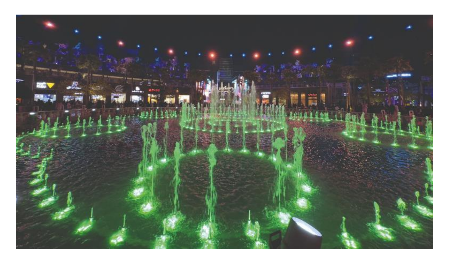
Boulevard World theme park, Riyadh: Saudia Arabia is looking to boost tourism

Given that oil revenues account for nearly 90% of exports and 70% of government revenues and more than 40% of GDP, according to Lloyds Bank, investment opportunities in Saudi Arabia are driven from the top. Joy says the first component for equity selection is therefore understanding the overall direction of government policy.