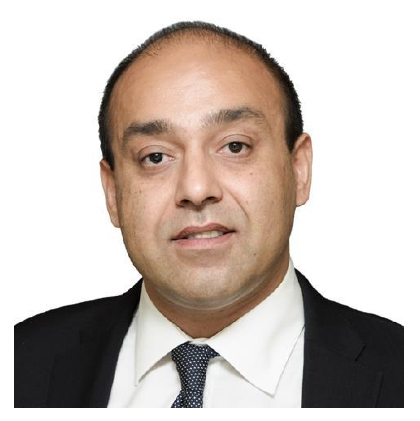
"There is huge potential in Saudi whether it's in existing sectors such as tourism, or in developing new sectors such as fintech"